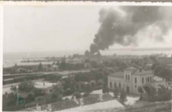
12.- -Foc in port.-