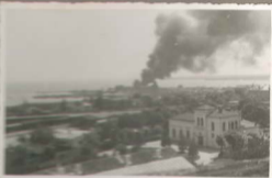
-Foc in port,-