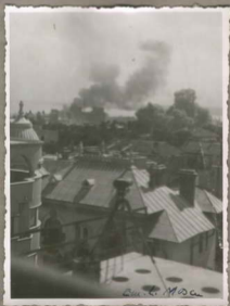
- Bombe în dosul silozurilor. -