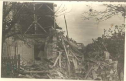
- Str. Eroilor -