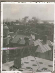
- Bombardarea portului. -