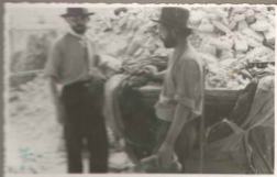
-Freddi e l'istru,-