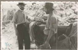
7.- -Prepari la lucre.-