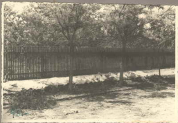
Unca de Jandarmii. -