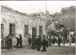
— Str. D. A. Sturza. —