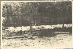
- Mortuiri dela Z...