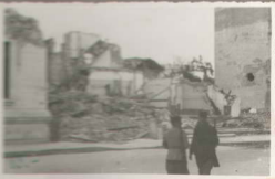
-Str. D.A. Sturza,-