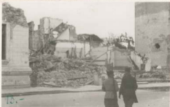
15.- -Str. D.A. Sturza.-