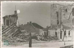
- Bulev. Regina Maria -